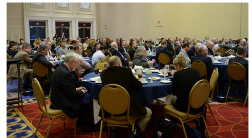
2015 ACHA Annual Certificate's Luncheon